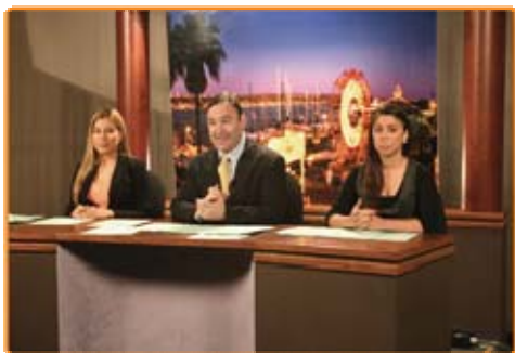
The news shows Around and About Orange County and Noticiero Latino broadcast weekly from TV/Video's fully equipped studios.