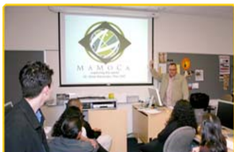
Advanced digital media arts students designed a complete branding campaign for DMC incubator resident, MaMoCa.

For more information, contact the DMC at :