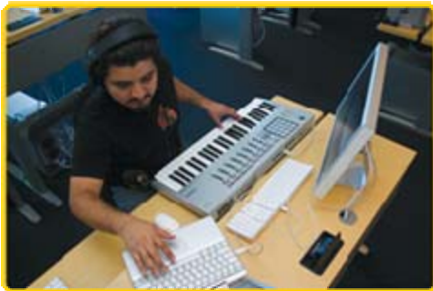
The music department provides industry-level training in soundtrack editing for music recordings, videos, and commercials.

The Santa Ana College instructional program at the DMC offers courses in television/video production, advanced digital media arts for print and Web, digital music post-production, audio and video editing, and DVD authoring, as well as short business seminars offered through the Public Service Institute (PSI).